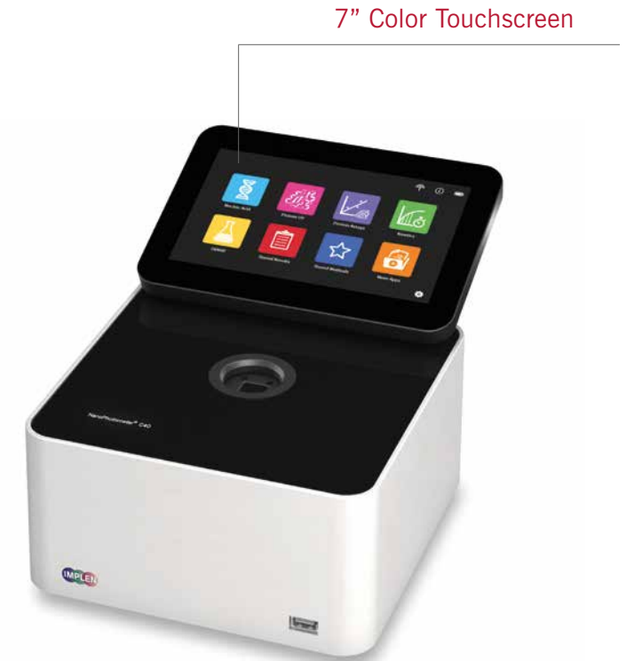
7" Color Touchscreen