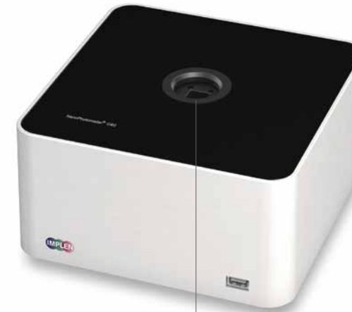
Temperature Controlled Cuvette Holder