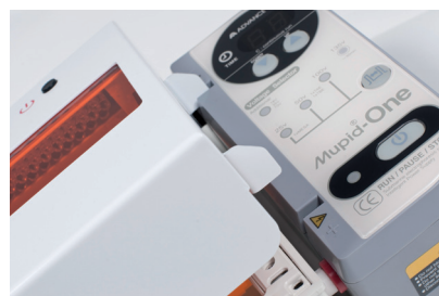
Fig. 1-4: LED's of the MUPID™ One LED Illuminator. The MUPID™ One LED Illuminator replaces the lid of the MUPID™ One electrophoresis chamber.