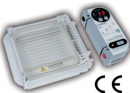
Fig. 1: The MUPID™ One Electrophoresis System